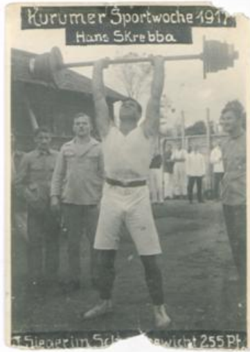
Sieger im Schweregewicht 255 Pf.